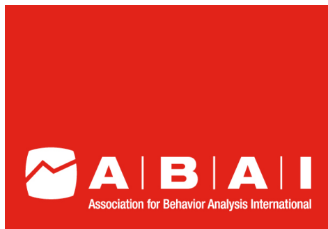
Association for Behavior Analysis International

Rebuilding Opportunity and its endorsers believe that a long-term nationwide effort to reduce concentrated disadvantage and increase opportunity in America's neighborhoods is vital to the future of the nation. Together, we urge action at the federal level and at the local level that focuses on reducing poverty, inequality, and discrimination and increasing the implementation of policies and programs that help families thrive.